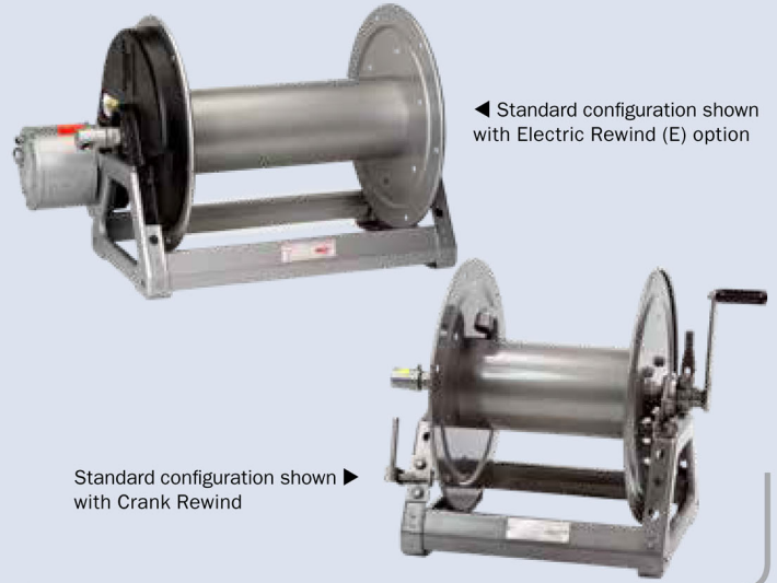
◀ Standard configuration shown with Electric Rewind (E) option