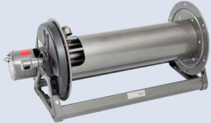
Standard configuration shown with Electric Rewind (E) option