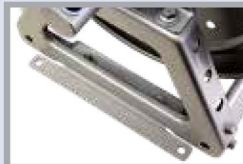
Standard configuration shown ▶ with Crank Rewind